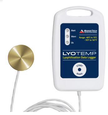
Compatible with the HiTemp140X2-FP data logger series, HiTemp140-FP data logger and the LyoTemp Data Logger.