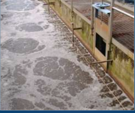
Water Temperature Monitoring