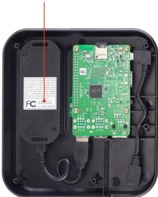
1a. Wireless Transceiver